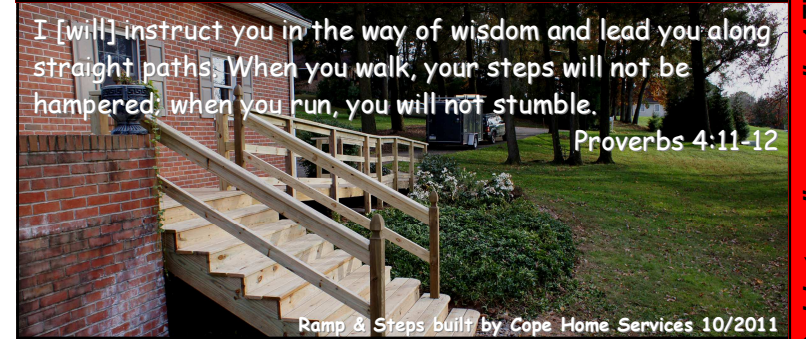
Ramp & Steps built by Cope Home Services 10/2011

Thank you for your interest in supporting God's plan in our lives.